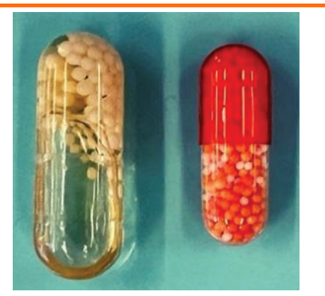
Figure 3. Images of capsules named Brand I and Brand II on left and right, respectively.

Brand I was composed of different oils that covered the HPMC granules containing caffeine. The release of caffeine from the capsule was probably affected by the surrounding barrier formed by the oil, preventing the dissolution media from accessing the granules and the hydrophilic caffeine passing through the oil layer (Fig. 3). Controlled drug release from a hydrophilic matrix based on HPMC follows several types of physical phenomena, such as water, drug, and polymer chain diffusion, polymer swelling, and subsequent dissolution of drug and polymer. Even in the case of freely water-soluble molecules, such as diprophylline and theophiline, saturation solubility effects can occur within the dosage form (while providing sink conditions outside), impeding drug release ( 19 ).